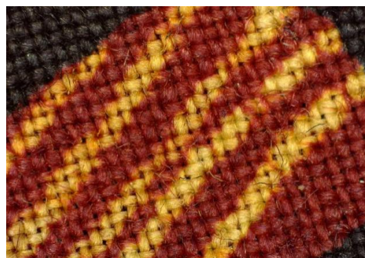
Figure 2. Sample of image type 2 for batik class