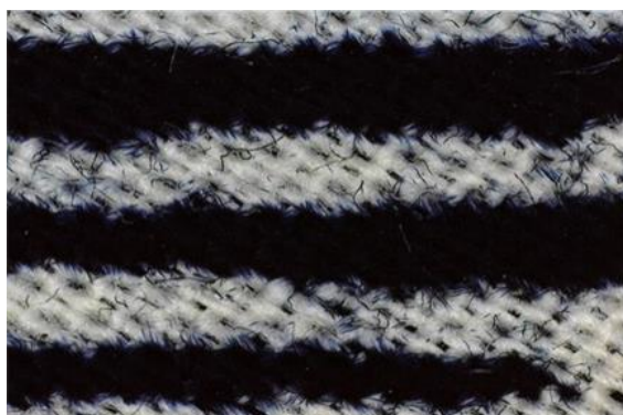
Figure 1. Sample of image type 1 for non-batik class

The experts says that in the first and second type of image the wax trait could be seems. Wax trait especially from the first wax sticking job is important to identify the authenticity of a batik products. The type 3 images are designed for mobile applications should a digital microscope is not available.